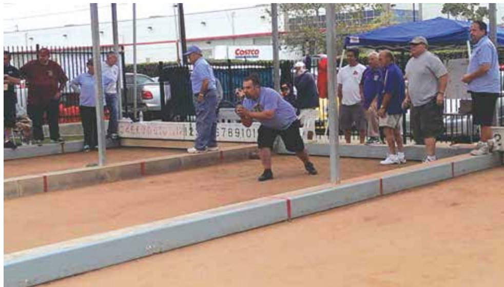
Players in the middle of a bocce match during the South Bay Bocce Courts project's Charity Tournament held in April.

difficult to master nature of the sport has made it popular with the FTEAs and older athletes who are no longer able to participate in strenuous contact sports. While not quite the workout that a game of basketball is, Bocce is still a good way of staying active