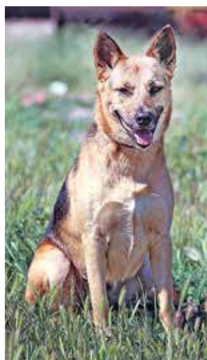
Jackie loves walks and family time.

Jackie is a beautiful 3 year old Shepherd/Lab mix. She was found as a stray and microchipped, but the people at the address she was registered to denied knowing her. So it's time for a new, better home for Jackie. Jackie is a wonderful dog who is 3 years old and weighs 68 pounds. She already knows how to sit and lay down on command. As she loves to go for walks and