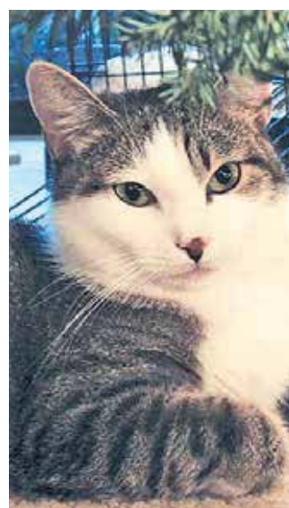
Arwen loves to be petted in a calm environment.

JellyBean is one very lucky kitten. He was discovered in a car engine, and his foster mom fished him out and cleaned him up. With his fluffy black coat, Jellybean is going out of his way to prove that black cats are lucky! And as if his handsome licorice coloring wasn't enough, he has developed hints of a white undercoat giving him a smoky appearance that is just too adorable for words. JellyBean absolutely loves other cats and even dogs. He is the perfect companion for a lonely cat as he is very high energy due to his youth. If you don't already have a kitty companion for him, Jellybean would love be adopted with Charleze, a gorgeous black female kitty who has adopted JellyBean as her baby or with fluffy grey kitten Constantine, who became his kitten companion upon his own rescue.