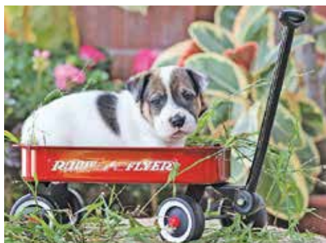
Spurs is a puppy who needs a family to love.

Spurs is one in a litter of 5 week old puppies we found being sold on the street corner: three boys and two girls. We DNA'd two puppies from this litter, so about the time they are 8 weeks old we will know what their breed is. We do know that they will be medium to large in size since they weigh