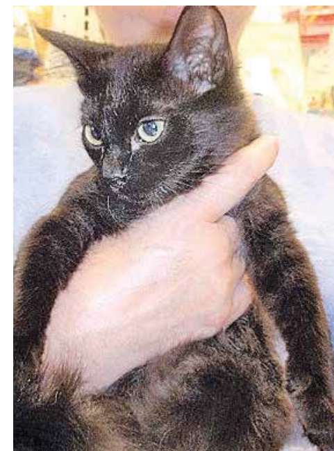
JellyBean is a great addition to a pet family.

Be kind. Save a life. Support animal rescue. •