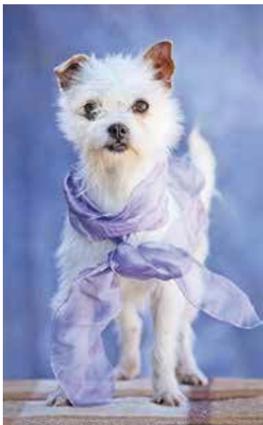
Lovey's favorite place is your lap.

Lovey is the sweetest dog ever! She was found as a stray in an empty lot with her two puppies; her owners were never located. Lovey is wonderful with all other dogs, loves all people and would like nothing better than to just hang out in your lap. She is very sweet, very smart and a very quick learner. With her cheerful personality, Lovey's tail is always wagging. She loves going for walks and is up for whatever outing you have planned. Lovey is spayed, current on vaccinations, microchipped, and fine with other dogs.