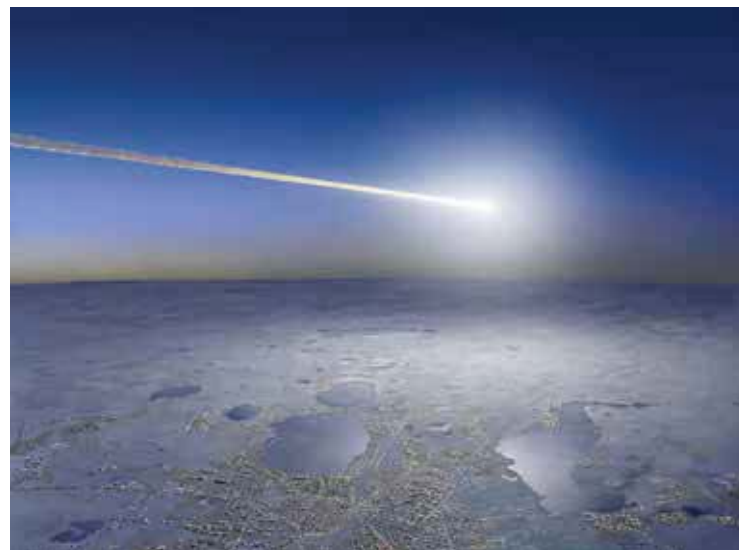
An artist's view of the Chelyabinsk "superbolide" event shows the meteor fragment which exploded over Russia last year. Credit: Don Davis for space.com

At a press conference April 22 at the Seattle Museum of Flight, three prominent astronauts supporting the B612 Foundation presented a visualization of new data showing the surprising frequency at which the Earth is hit by asteroids. The astronauts were guests of the Seattle Museum for a special series of public events on Earth Day 2014.